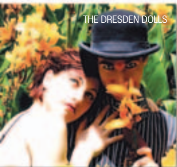
THE DRESDEN DOLLS