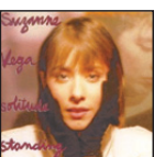
Suzanne Vega Solitude Standing (A&M)

Veteran singer songwriter has existed on a lower tier of popularity than contemporaries like Sara McLachlan and Alanis Morissette, despite the fact that she often has more to say, and says it better.